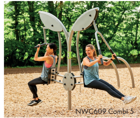
NWC609 Combi 5

HEIGHT: 125 cm LENGTH: 93 cm WIDTH: 50 cm IN-GROUND: 25 cm WEIGHT: 25 kg Free fall height: 94 cm ZONE: 11,9 m 2