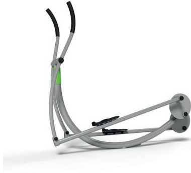
Standard powder coated steel