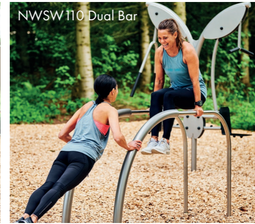
NWSW110 Dual Bar