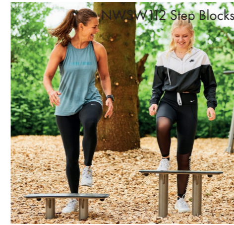
NWSW112 Step Blocks