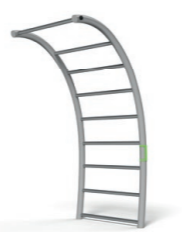
NW104 Pull Up

HEIGHT: 56 cm LENGTH: 216 cm WIDTH: 39 cm IN-GROUND: 25 cm WEIGHT: 35 kg Free fall height: 56 cm ZONE: 17 m 2