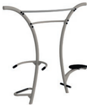
NWC603 Combi 1

HEIGHT: 223 cm LENGTH: 260 cm WIDTH: 108 cm IN-GROUND: 30 cm WEIGHT: 110 kg Free fall height: 116 cm ZONE: 20,9 m 2