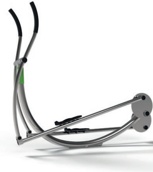
Premium stainless steel