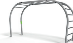
NWSW109 Horizontal Ladder

HEIGHT: 205 cm LENGTH: 103 cm WIDTH: 377 cm IN-GROUND: 40 cm WEIGHT: 200 kg Free fall height: 205 cm ZONE: 36,7 m 2