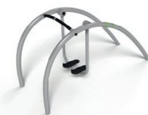
NW201 Air Walker

HEIGHT: 93 cm LENGTH: 191 cm WIDTH: 68 cm IN-GROUND: 25 cm WEIGHT: 65 kg Free fall height: 93 cm ZONE: 15,4 m 2