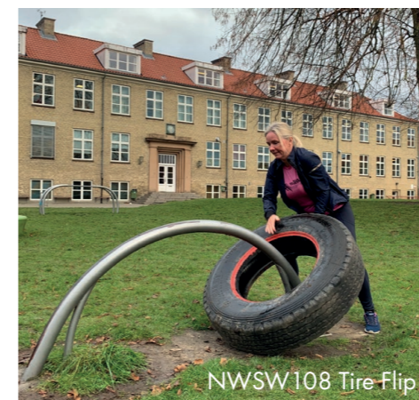
NWSW108 Tire Flip