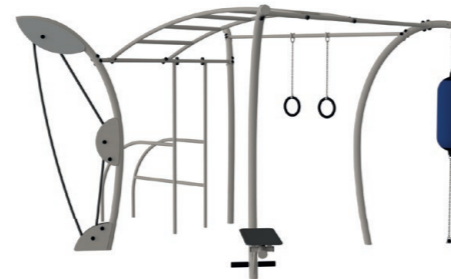
NWC608 Functional Training

HEIGHT: 239 cm LENGTH: 335 cm WIDTH: 335 cm IN-GROUND: 30 cm WEIGHT: 505 kg Free fall height: 239 cm ZONE: 35,5 m 2