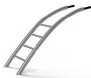
NW110 Multi Ladder

HEIGHT: 198 cm LENGTH: 83 cm WIDTH: 308 cm IN-GROUND: 40 cm WEIGHT: 83 kg Free fall height: 98 cm ZONE: 22 m 2