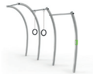
NWSW114 Triple Pull Up

HEIGHT: 225 cm LENGTH: 104 cm WIDTH: 292 cm IN-GROUND: 40 cm WEIGHT: 195 kg Free fall height: 121 cm ZONE: 21 m 2