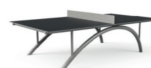
NW502 Ping Pong

HEIGHT: 51/78 cm LENGTH: 142 cm WIDTH: 48 cm IN-GROUND: 25 cm WEIGHT: 72 kg Free fall height: 78 cm ZONE: 13,5 m 2