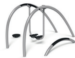
NWC605 Combi 3

HEIGHT: 223 cm LENGTH: 260 cm WIDTH: 108 cm IN-GROUND: 30 cm WEIGHT: 110 kg Free fall height: 116 cm ZONE: 20,9 m 2