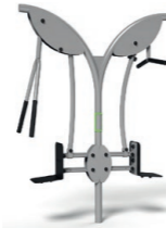
NWC609 Combi 5

HEIGHT: 127 cm LENGTH: 253 cm WIDTH: 215 cm IN-GROUND: 25 cm WEIGHT: 150 kg Free fall height: 40 cm ZONE: 25,6 m 2