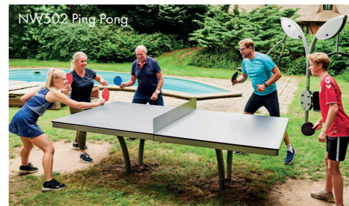
NW502 Ping Pong