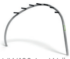
NW108 Arm Walker

HEIGHT: 223 cm LENGTH: 132 cm WIDTH: 103 cm IN-GROUND: 40 cm WEIGHT: 86 kg Free fall height: 137 cm ZONE: 15 m 2