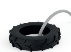
NWSW108 Tire Flip

HEIGHT: 54 cm LENGTH: 302 cm WIDTH (tire): 121 cm IN-GROUND: 25 cm WEIGHT (ex tire): 30 kg Free fall height: 54 cm ZONE: 21,6 m 2