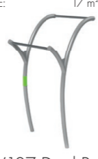
NW107 Dual Pull Up

HEIGHT: 220 cm LENGTH: 93 cm WIDTH: 61 cm IN-GROUND: 40 cm WEIGHT: 75 kg Free fall height: 60 cm ZONE: 11,9 m 2