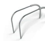
NWSW110 Dual Bar

HEIGHT: 205 cm LENGTH: 103 cm WIDTH: 377 cm IN-GROUND: 40 cm WEIGHT: 200 kg Free fall height: 205 cm ZONE: 36,7 m 2