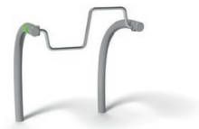
NWS113 Hand Cycle

HEIGHT: 116 cm LENGTH: 92 cm WIDTH: 93 cm IN-GROUND: 25 cm WEIGHT: 40 kg Free fall height: 116 cm ZONE: 11,6 m 2