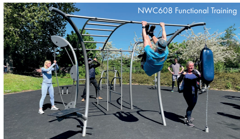
NWC608 Functional Training